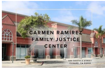
Future home of the Carmen Ramirez Family Justice Center, scheduled to open January 2025

The Ventura County Family Justice Center is a welcoming community that empowers and supports survivors of all ages and their families, through comprehensive, holistic services that focus on the whole person. Our collaborative approach creates a safe space where we use strength-based practices to end abuse and exploitation, pursue justice and create pathways to hope. The Family Justice Center serves victims of the following crime types: Domestic violence, sexual assault, child abuse, elder and dependent adult abuse, human trafficking and hate crimes. The Ventura center opened in 2019, while the Carmen Ramirez Family Justice Center in Oxnard is scheduled to open in 2025. A third center in the East County will open in the future, after the Oxnard location.